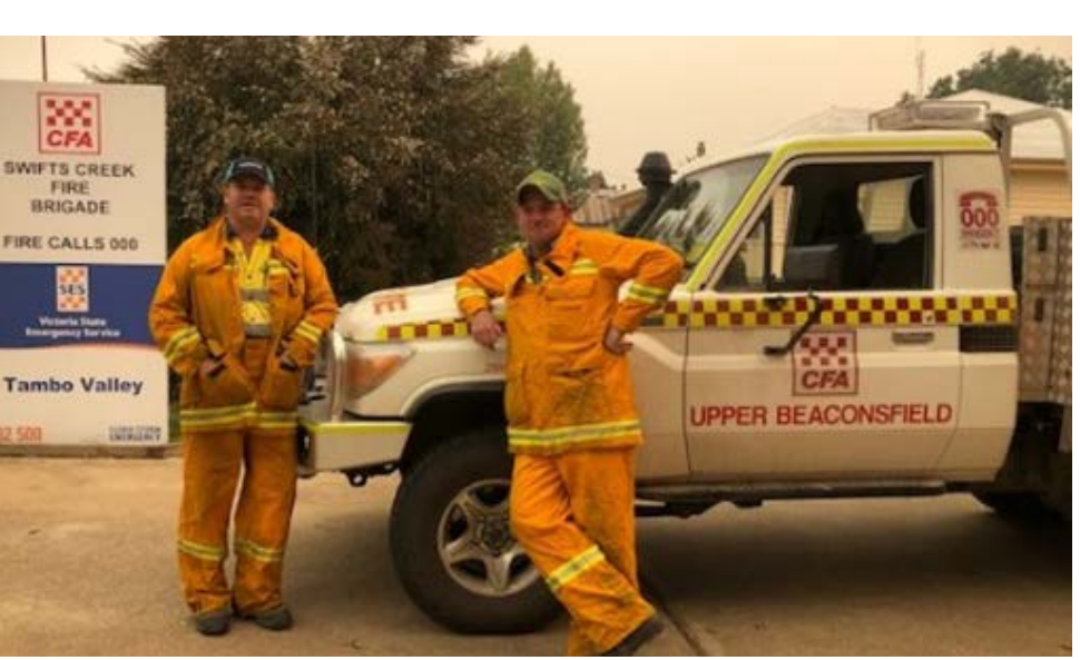
An ultra-light tanker vehicle ready for a fast response

Located in the Victorian High Country with the Alpine National Park, Dinner Plain and Mt Hotham ski fields close by. The tourist road, "The Great Alpine Road" is an iconic road trip for motor bikes because of the amount of bends. Omeo (20km up the road) is being developed as a Mountain bike mecca. The pump track opens at end of the month and later this month.